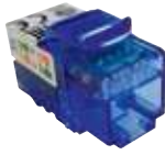
RJ45 Cat. 6A UTP Connector (500 MHz) Ref. 82021 (Blue)