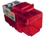
RJ45 Cat. 6 UTP Connector (250 MHz) Ref. 21978 (Red)